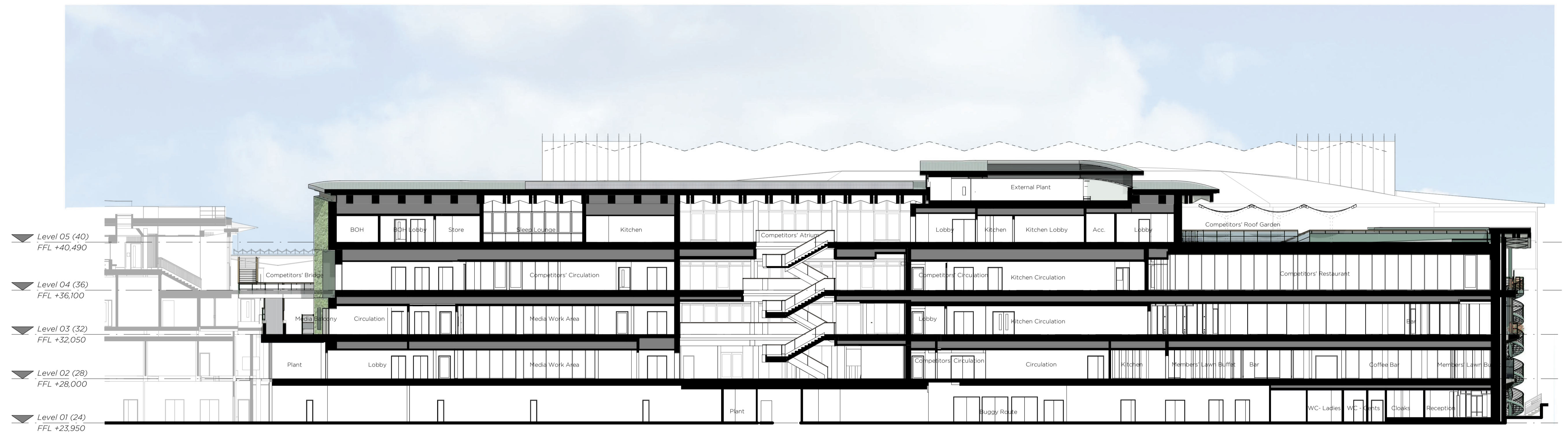
Planning Section EE